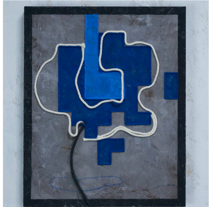
Title: Hope in the Glitch.2

Year: 2026 Size: 27.3 x 22cm Material: Mixed media on wooden panel