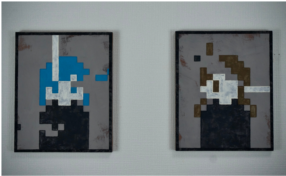
Title: Decay Curve.1 (left side) & Decay Curve. 2 (right side)