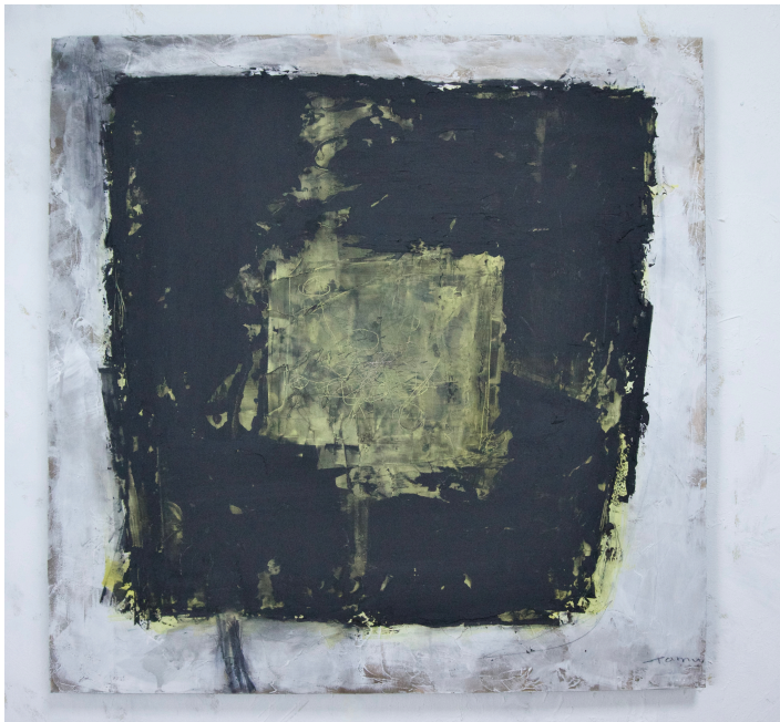
Title: Kaiju ni Hana

Material: acrylic and modeling-past on wooden panel