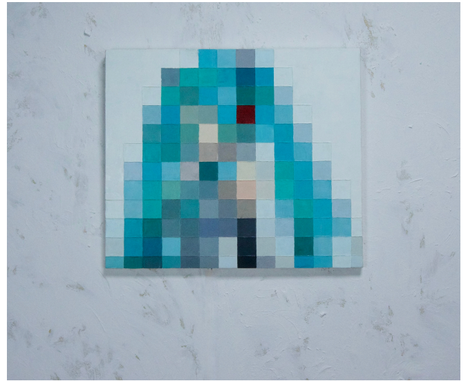
Title: New Music

Year: 2025 Size: 31.8 x 41cm Material: oil and wax on wooden panel